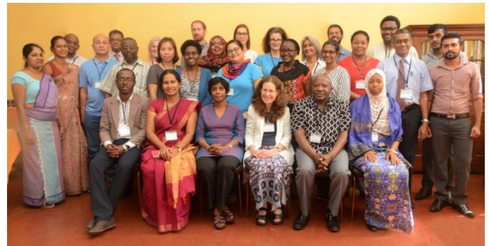
Participants of the AuthorAID global partners meeting with the Dean of the Faculty of Medicine and the RPFC members

The Author Aid Global Partners meeting was successfully held in the Faculty of Medicine, Colombo, Sri Lanka in December 2017, hosted by the RPFC and was attended by representatives from networking partners of RWSP, international researchers and organisations contributing to Author AID and also by the partners from developing countries that were or are currently funded by INASP to develop programs that promote research writing. The RWSP was highly commended by the participants and some international participants planned to commence RWSPs similar to that of RPFC in their institutions.